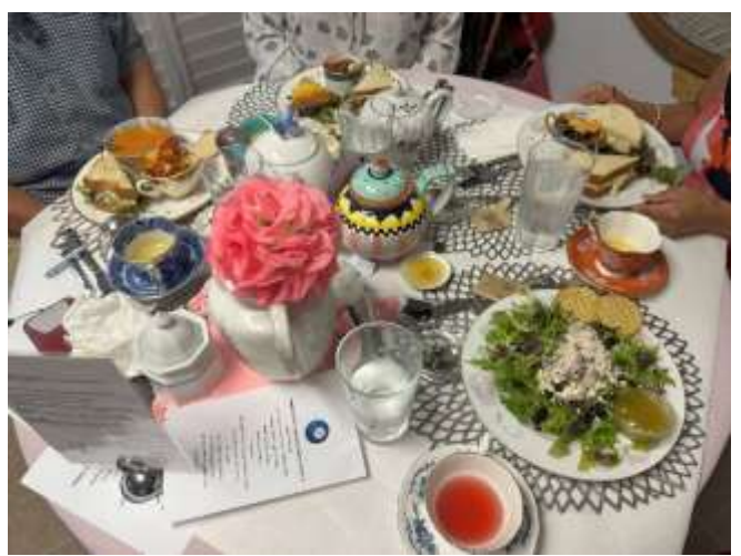
Lovely selection of Sandwiches, Salads & Tea