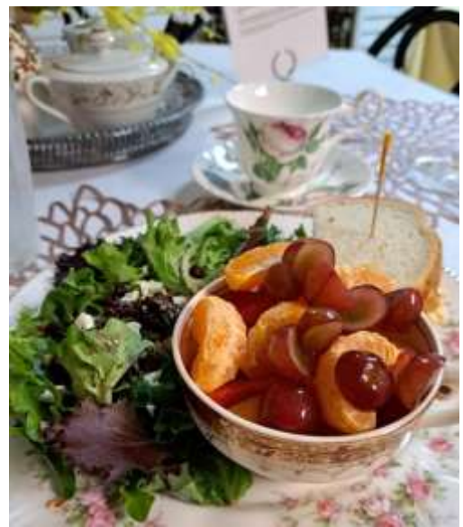
A plate full of goodies!