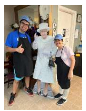
A special "guest" joined us!