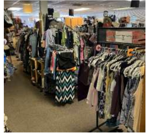
Thrift Store fully stocked