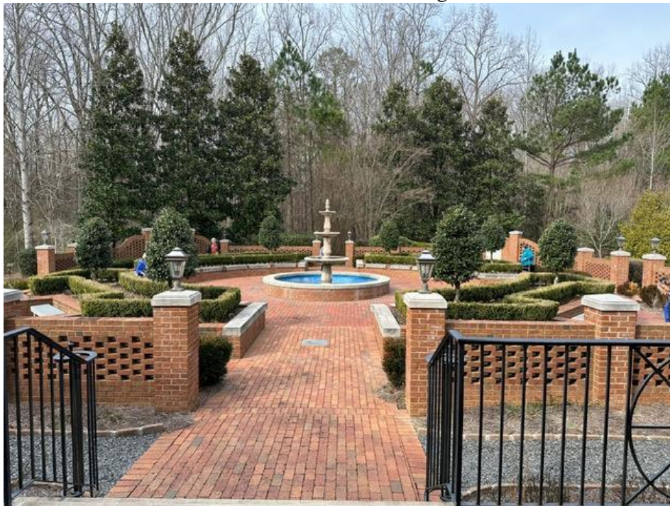
Pilot International Memorial Garden