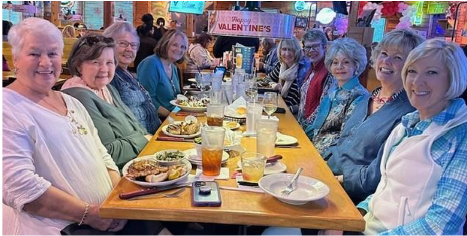
Pilots enjoying each others company with a wonderful meal