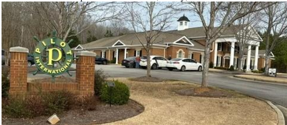
Pilot International Headquarters entrance