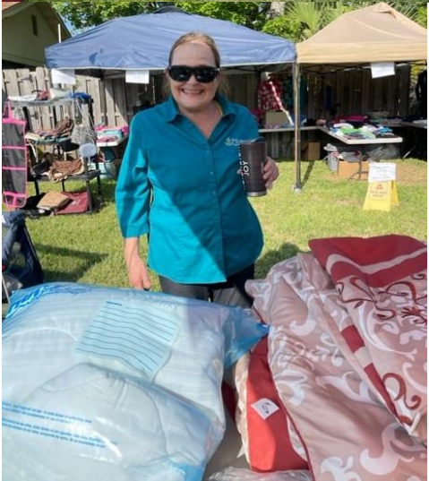
Joy keeping the linen area tidy