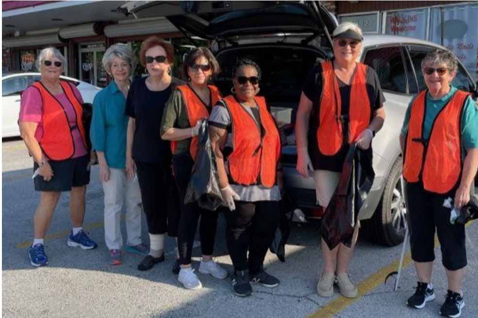
Pilots lining up for our orange vests, gloves, and garbage bags. Ready to clean the mean streets of Avondale!