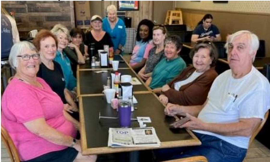
Our reward for the litter pickup – breakfast and fellowship