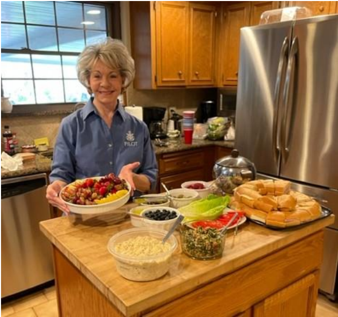
Georgia keeping the volunteers nourished