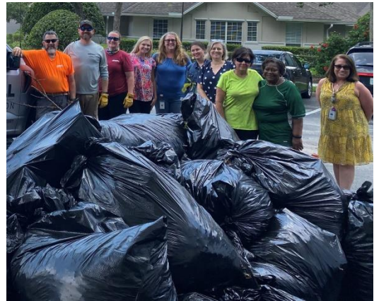
Pilots, friends & Community Hospice Staff in Garden end of day on June 28 th