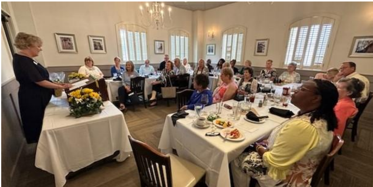
Pilot Club of Jacksonville members joining in the celebration